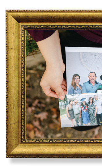
75 million people in America live in areas with little or no access to quality, affordable primary care.