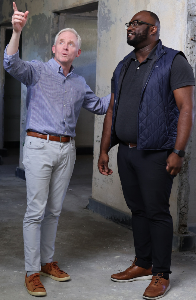
Envisioning the future interior of Slossfield

Proverbs 11:25, typically translated, “Whoever refreshes others will be refreshed,” paints a richer picture in the original Hebrew. More literally, it reads, “The one who waters will himself be watered.”